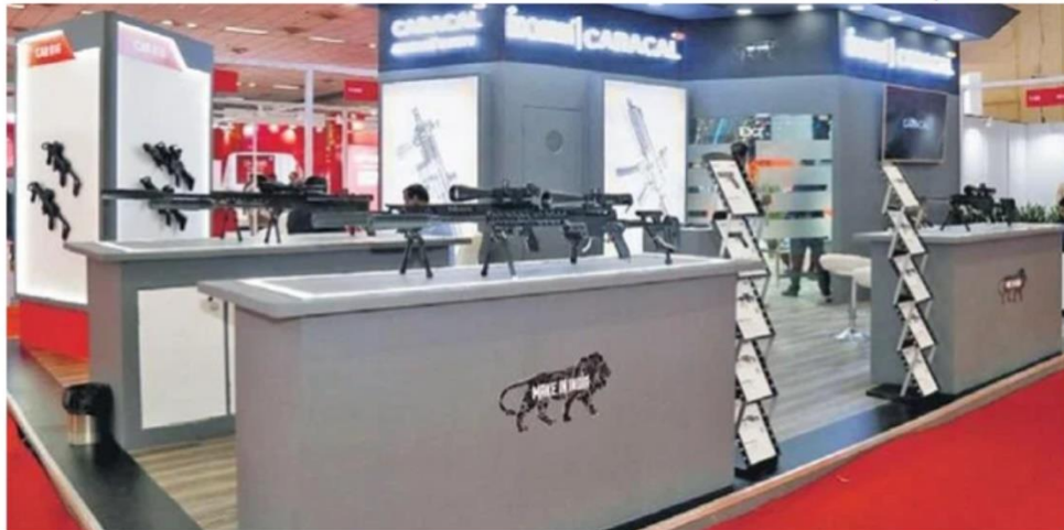
Hyderabad-based CARACAL-ICOMM displayed combat pistols, sub-machine guns, rifles and sniper rifles at Milipol from October 26 to 28 in New Delhi

Defence equipment Exhibition: बम की दूर से पहचान कर निष्क्रिय करेगा स्वदेशी रोबोट, जार्ने और क्या है खूबियां